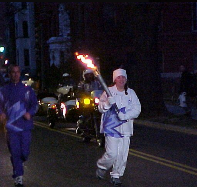
2002 Olympic Torch Relay as it passed thru Washington DC for the Winter Olympic Games in Salt Lake City, UT. https://www.flickr.com/photos/boothbearwdc/35045683