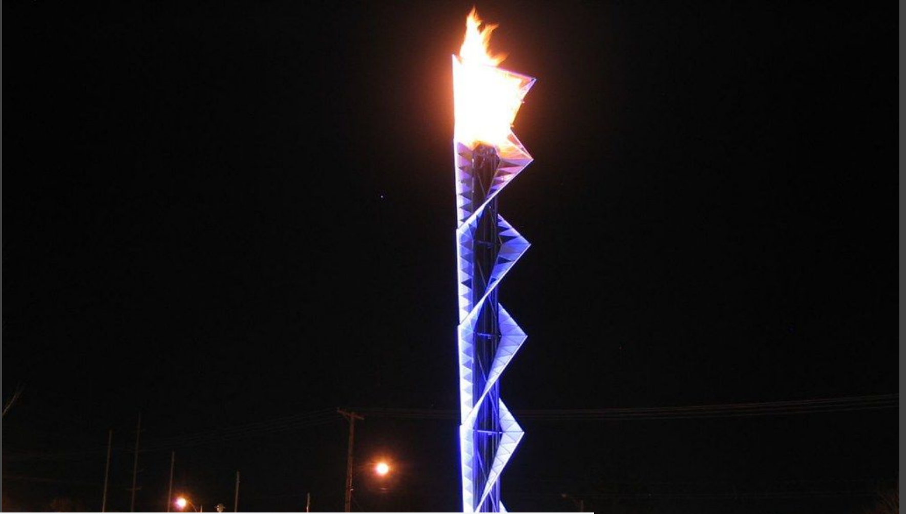
Salt Lake 2002 Olympic Cauldron Park, Rice-Eccles Stadium, Salt Lake City, Utah; https://www.flickr.com/photos/kenlund/99111453