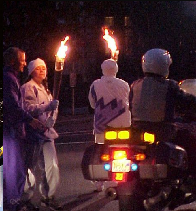
Passing the 2002 Salt Lake City Winter Olympics torch