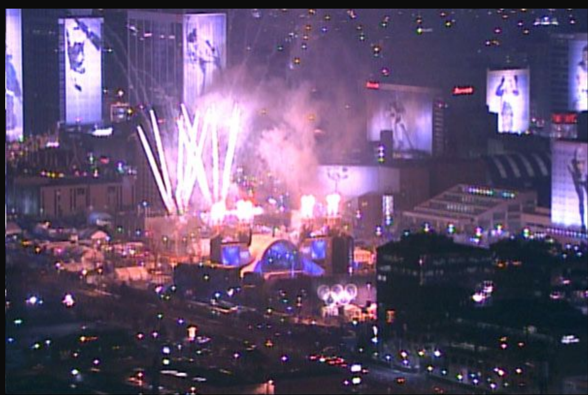
Fireworks at the Olympic Medals Plaza in downtown Salt Lake City during the 2002 Winter Olympics