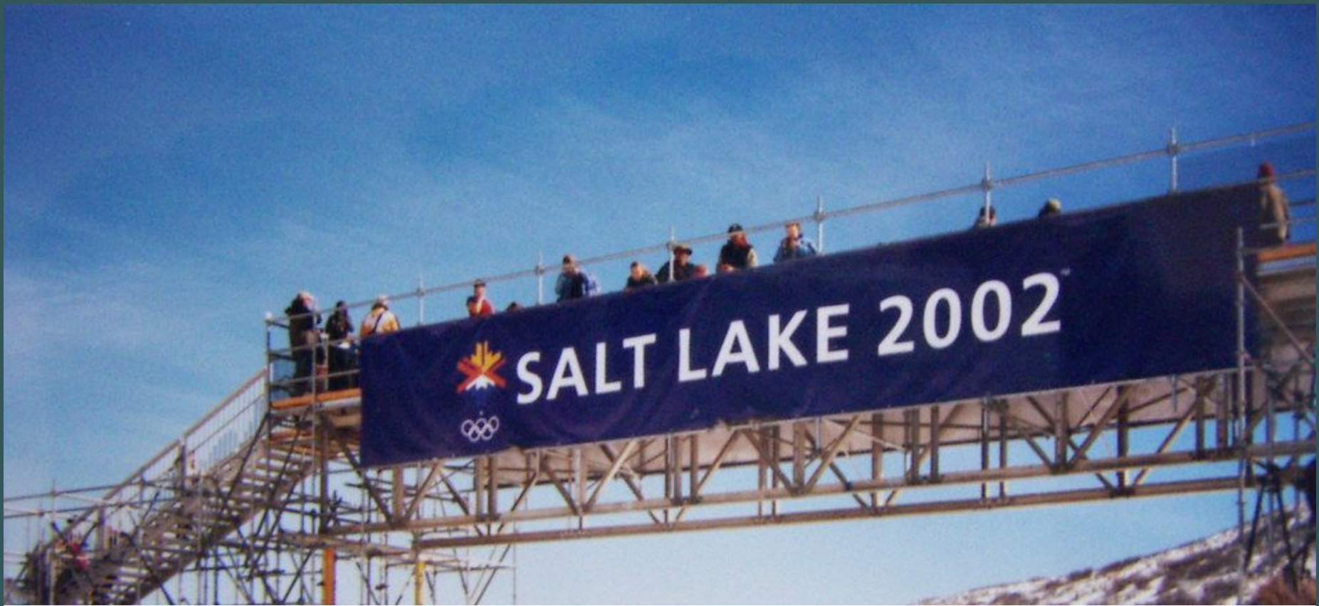
Soldier Hollow - Salt Lake City 2002 Olympic Winter Games

The Winter Olympics were held in Salt Lake City in 2002.