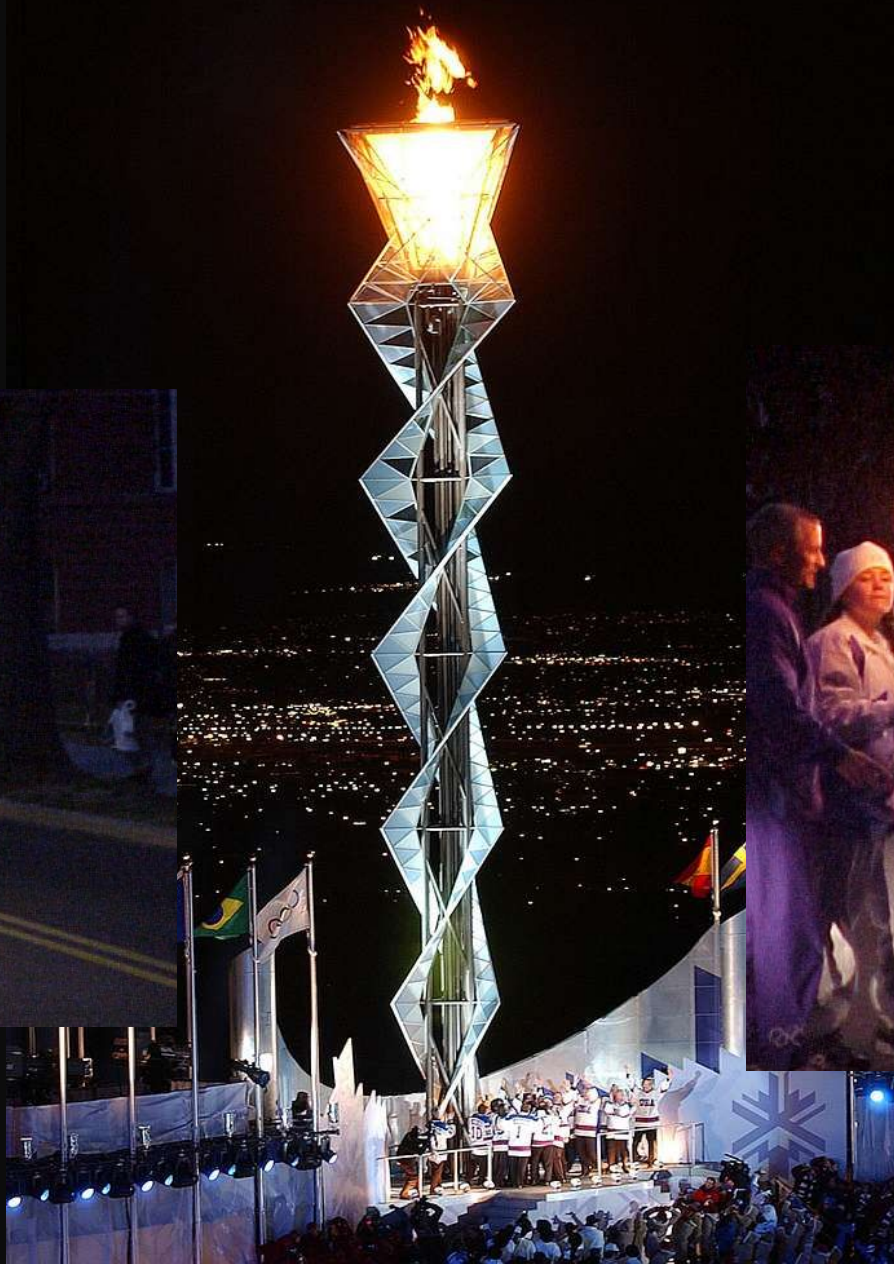
2002 Olympics - 1980 Hockey Team