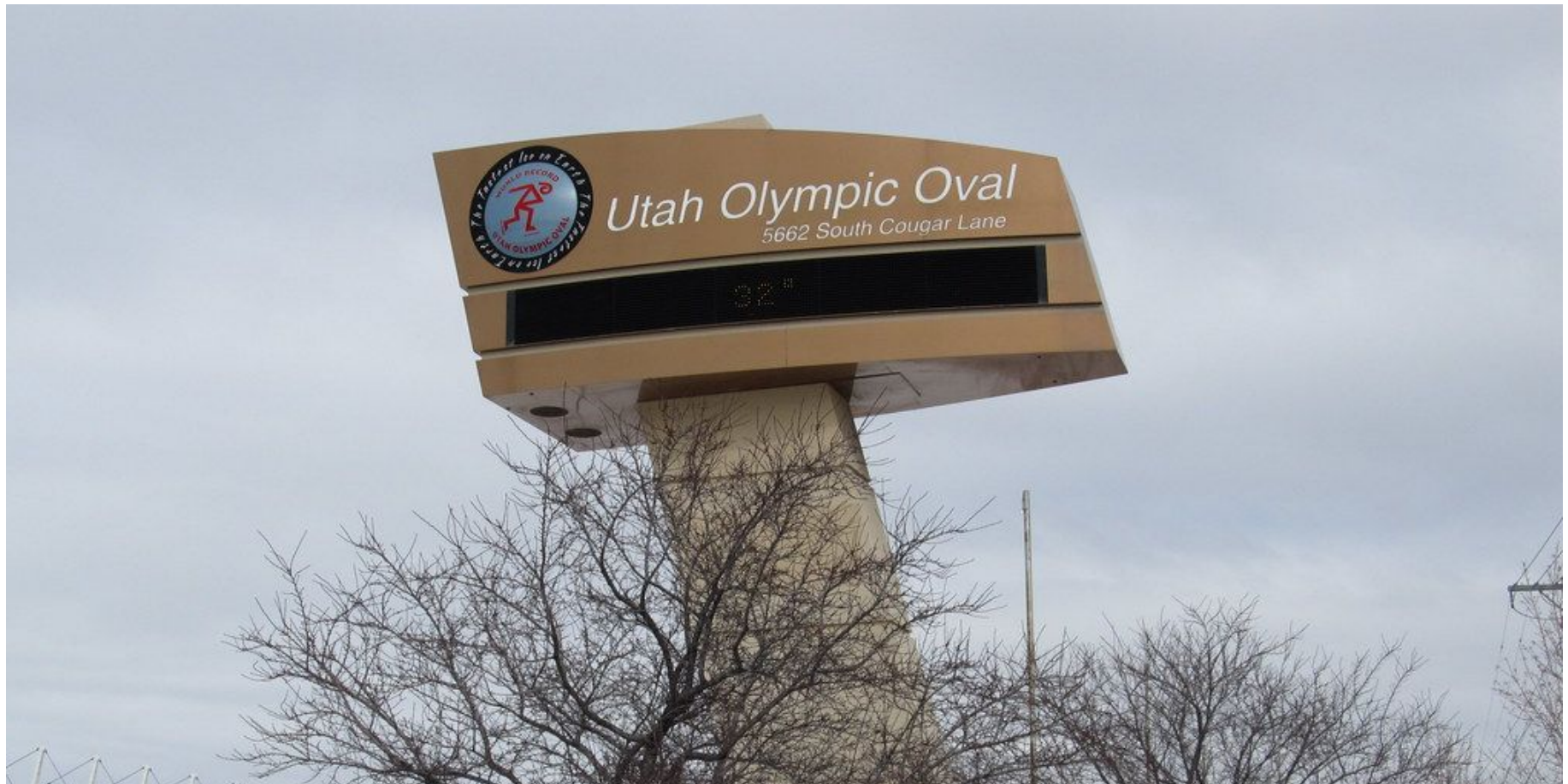
Utah Olympic Oval, Kearns, Utah